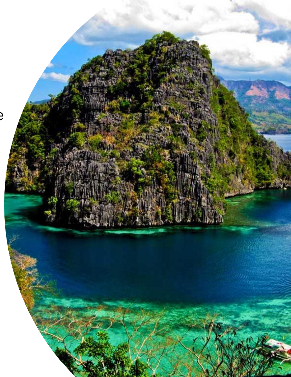
Image: Puerto Princesa National Park on Palawan Island ([Palawan Island], 2024)