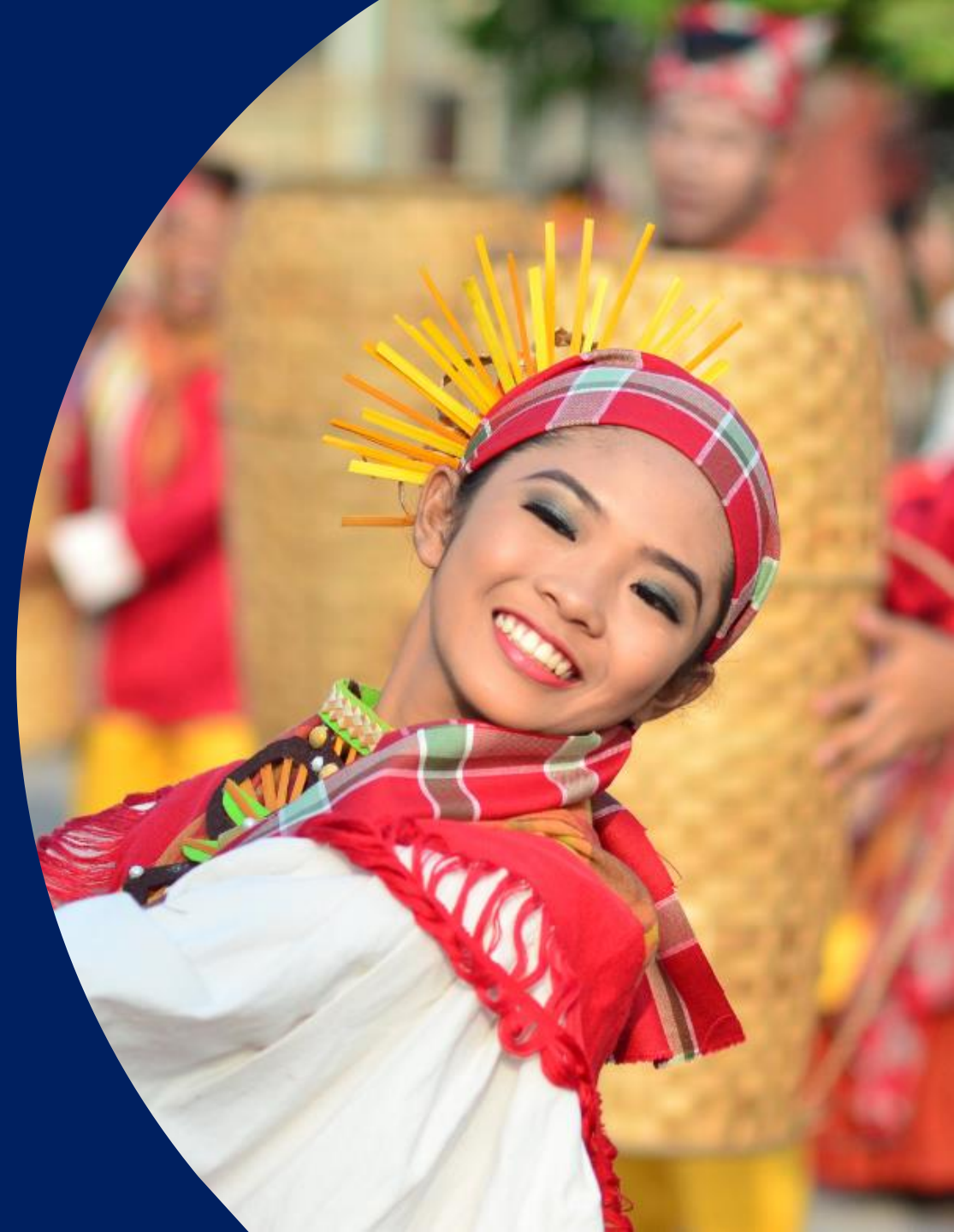
Image: Filipino Dancer at a Festival.