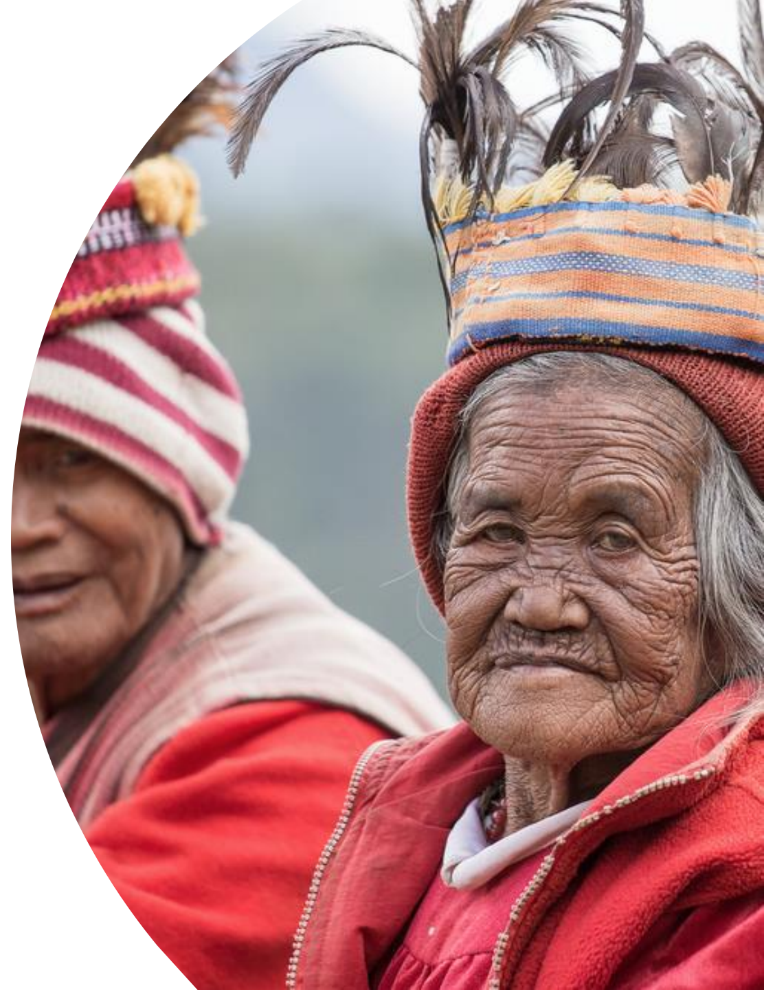
Image: Elders of the Ifugao.